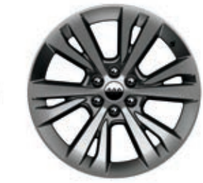
KING RANCH 22" 6-Spoke Painted